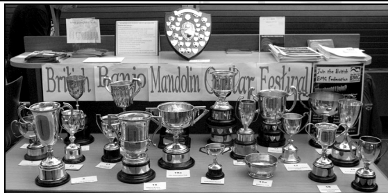
A photograph of the assembled cups and trophies